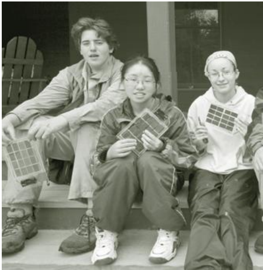
Wilderness trippers show off their homemade solar battery chargers.