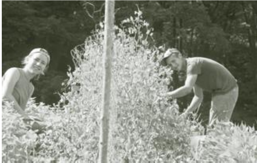
Spring is here! We'll be picking peas again at Salt Marsh Farm before we know it.